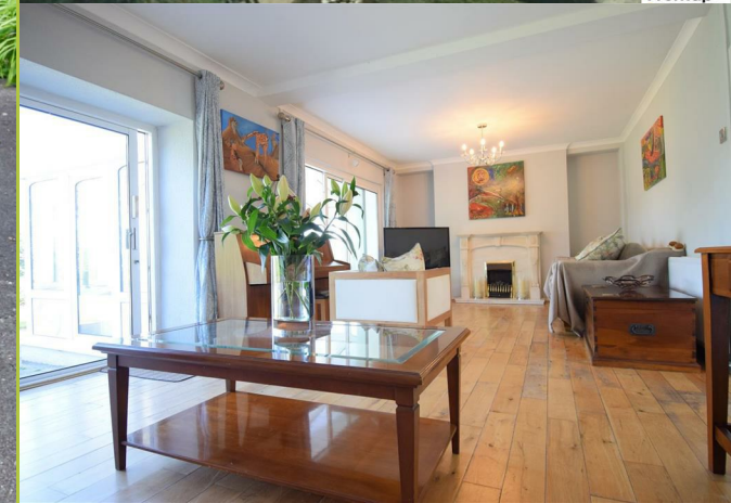
Bryn Coch, Tydu Road, Treharris, CF46 6PH Offers Around £700,000